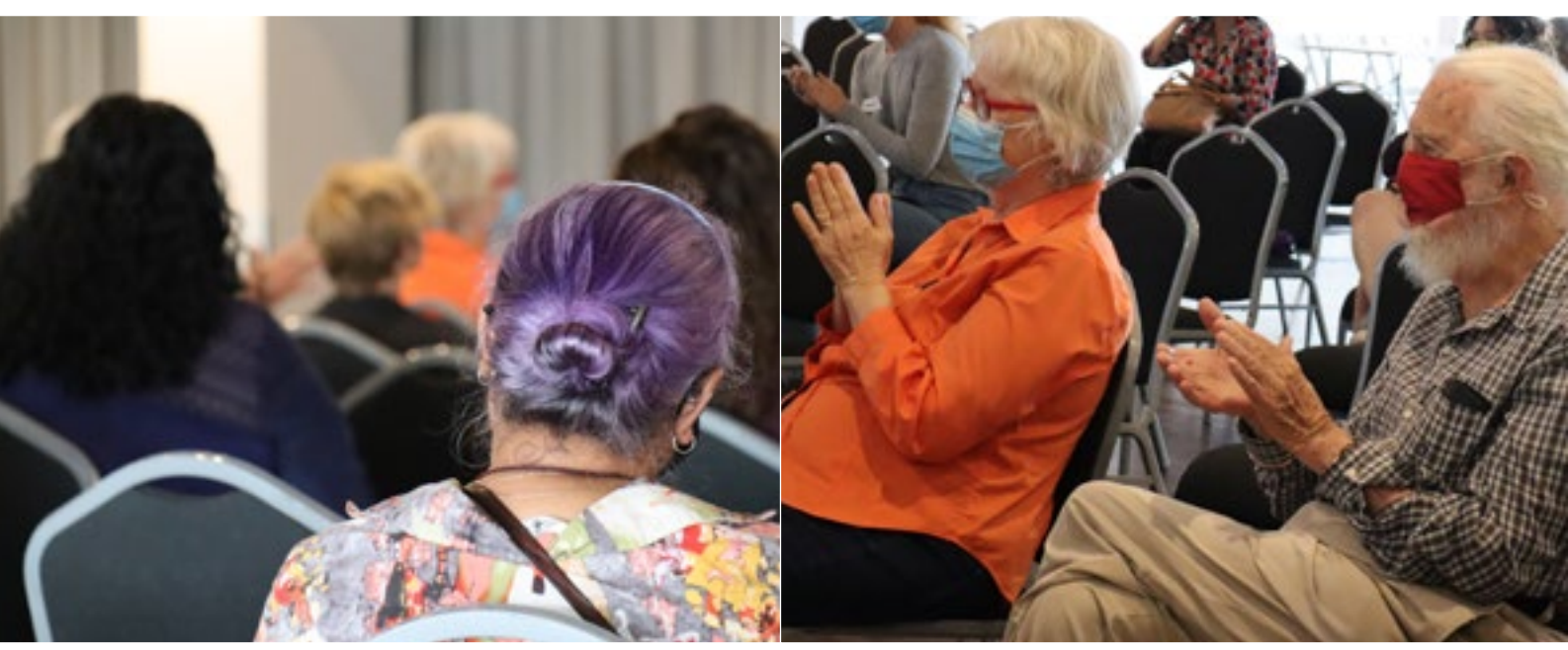
Treaty Advancement Committee community briefing, Brisbane, October 2021.