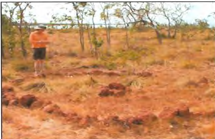
Paleolithic Maccasan Stone arrangement Salawesi Indonesia

Small Scale Miners are not supportive and reject the need of reconsidering the threshold for formal cultural heritage assessments for Land Users and believe that this proposal is disproportionate and inappropriate given the minor amount of Cultural Heritage that has been historically discovered or disturbed on Small scale mining tenures.