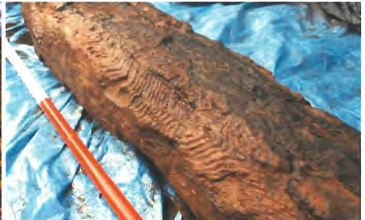
6000 year old Carved Oak found in Rhondda Valley Wales