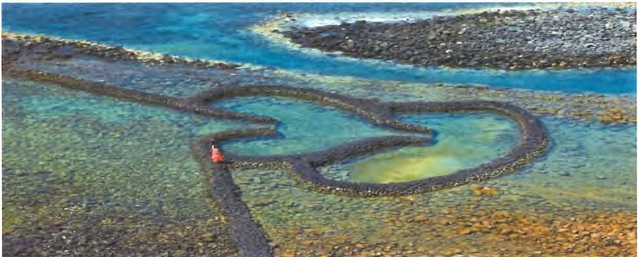
The Fish-traps of Penghu, 1 of the 570 fish-traps that dot the coast of Taiwan and have operated since Qing Dynasty

Aboriginal Land Claimants may have also included these “exclusive areas” within their Native Title land claim applications, however are “excluded areas”, from any Native Title Determination as the background - land tenure was freehold, GHPL, or some special lease which extinguishes Native Title.