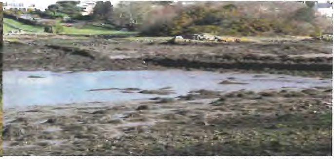
Remains of ancient stone fish traps in the tidal Menai Strait in Wales