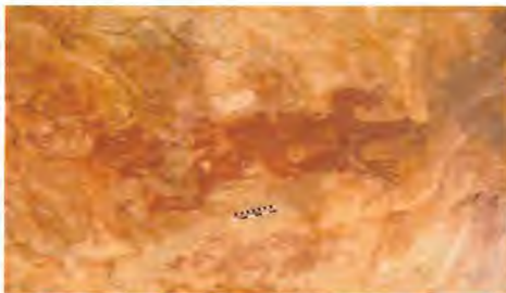
Mesolithic Rock art Kurnool, India