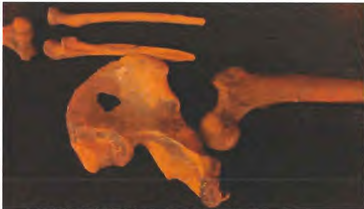
The Red Lady of Paviland remains buried about 29000 years ago