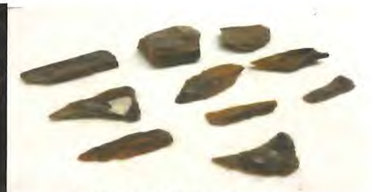
Neolithic Flint tools from Denmark