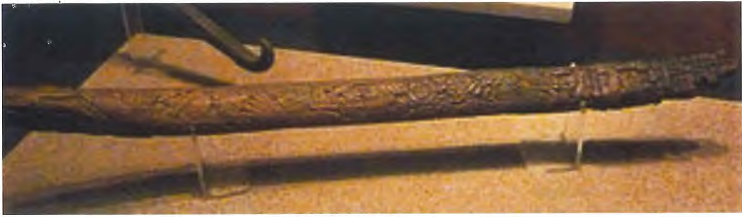
Neolithic Carved Aztec Atlatl (Woomera) at the National Museum Mexico