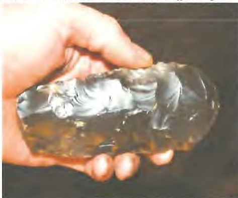
Below – Neolithic Tranchet Axe head –Suffolk England

From our collective experience, Aboriginal consultation will consequentially result in demands for negotiation costs, inspection clearance costs, monitoring regimes and associated costs, to merely name a few, and will inevitably cause the Land User associated time delays in managing the proposed project regardless of whether there is any Cultural Heritage on the land-users work area or not.