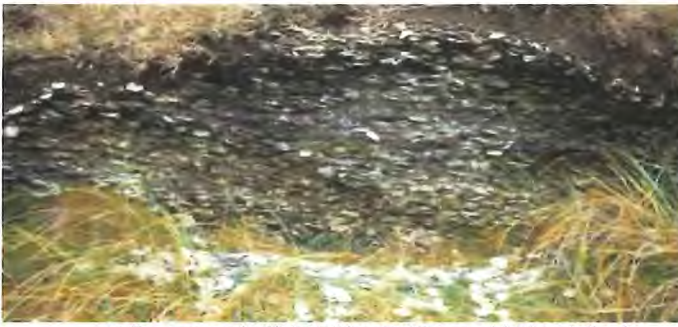
Culleenamore shellfish Middens 3000 years old. Sligo, Ireland