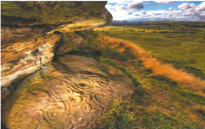
5000 year old Neolithic stone carving Northumberland England

That the Land-User (Miner or Explorer) can undertake activities after the 3 month period using the Duty of Care Guidelines if parties fail to reach an amicable agreement