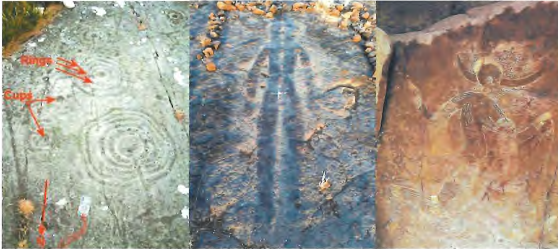
Petroglyph engravings - Westwood Moor Northumberland England