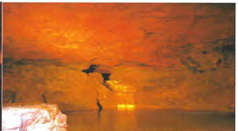
Clearwell Caves- Ochre mines Gloucestershire England mined for over 4000 years Discovered in Wales. UK.

In Victoria, where the DATSIP draws its example above, the costs to the Land user are first to engage a Cultural Heritage advisor, then "fees" are paid to the organization who approves the CHMP (the Registered Aboriginal Party (RAP) for the area or Aboriginal Victoria if a RAP hasn't yet been appointed.