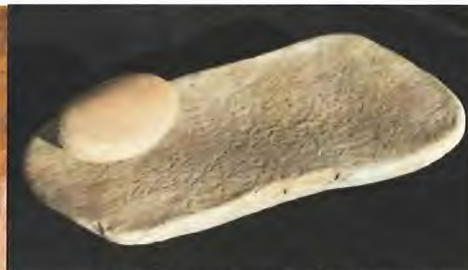
Neolithic Grinding stones and Quern-Northern Germany