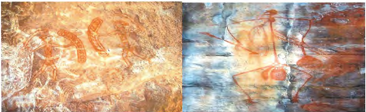
Above :- Neolithic Rock paintings in the Bhimbetka caves (India)

The practice by the State support of utilising the "Last Man standing" principle is remiss, and could possibly lead to legal proceedings against the State from a Land-user proponent or future Native Title claimant, if either were wronged from this legislation.